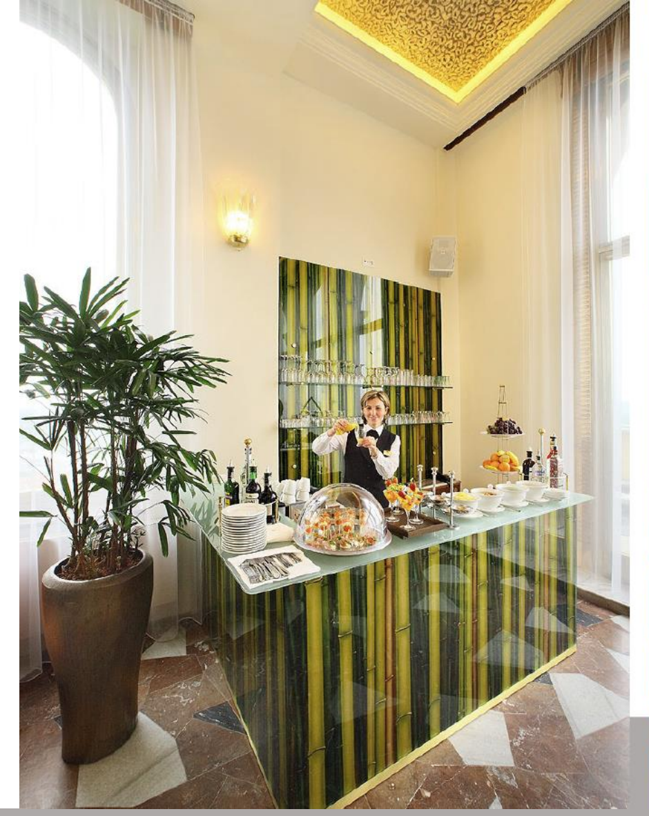
LEGENDARY TOWER WITH BALCONIES